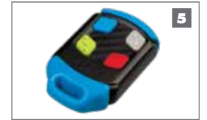
CENTSYS transmitters Available in one-, two- and four-button variants. Incorporates code-hopping encryption