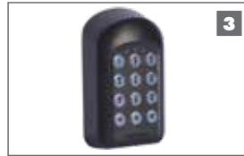
SMARTGUARD or SMARTGUARDair keypad Cost-effective and versatile wired and wireless keypad, allowing access to pedestrians