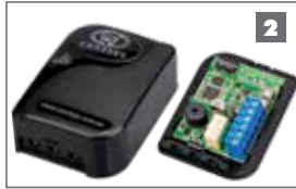
WiZo-Link module Wireless input-output module using mesh network technology creating fully-wireless connections between devices