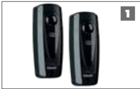
Photon SMART Infrared photocells Wireless infrared photocells