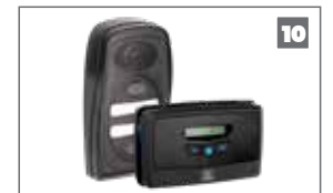
CELLULAR INTERCOM Infused with the DNA of innovation, the G-SPEAK ULTRA allows wireless communication between the user and the intercom gate station, effectively turning the user's phone into the intercom handset