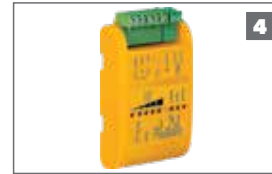
FLUX SA Loop Detector Allows free-exit of vehicles from the property - requires ground loop to be fitted