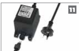
Low-voltage power supply If 240V power at the gate is not feasible, this optional low-voltage power supply kit is a simple, cost effective option