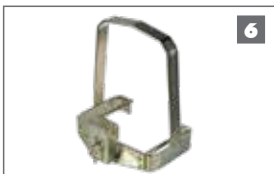
Theft-resistant cage & padlock Retro-installable steel cage that increases the resistance of the operator against theft